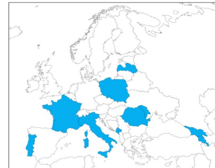
Compendium of Case Studies on Broadband Mapping Systems Across the EMERG and EaPeReg Regions